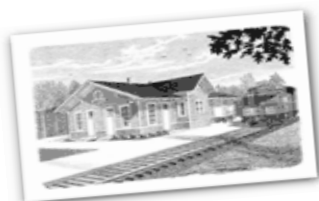
Friends of Fairfax Station