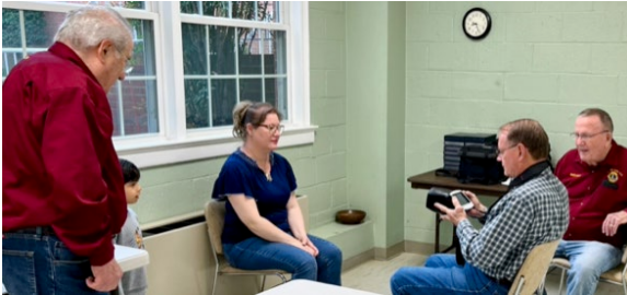
Lions screen vision of Pre-school staff

One April 11 & 12, Fairfax Lions conducted vision screening at Fairfax United Methodist Church Preschool. We screened 22 students, aged 3-5. Only one needed to be referred to an optometrist for further testing. The Fx County Health Department joined us to screen hearing of pre-schoolers.